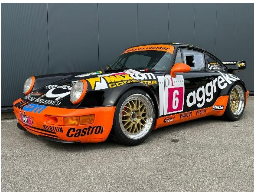
1994 Porsche Carrera 3.0 RSR Ex Harald Grohs car Ready for racing

FOR SALE Stock #: 23-049 Year: 1994 Make: Porsche Model: 964 Carrera RSR 3.8 Club Sport Color Exterior: Black Color Interior: Black Mileage: 9,150 Miles (14,738 Km) Motor Configuration: M64/04 3.8 Liter, 349 HP Transmission: 5-Speed Manual Price: Price on Request