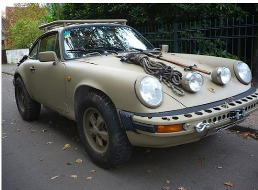
1986 Porsche SC Safari Modified - Extremely Rare Enjoy driving it On- or Off-Road

FOR SALE Stock #: 23-047 Year: 1986 Make: Porsche Model: 911 SC – Safari Modified Color Exterior: Desert Beige Color Interior: Black Mileage: Motor Configuration: 3.2 Liter Transmission: 5-Speed Manual Price: Price on Request