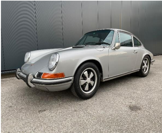
1969 Porsche 911S Coupe Matching Numbers

FOR SALE Stock #: 23-053 Year: 1969 Make: Porsche Model: 911S, Coupe, LWB Color Exterior: Silver Color Interior: Black Mileage/Odometer: 120,000 Miles Motor Configuration: 2.0 Liter, 170 HP, MFI, Air Cooled Transmission: 5-Speed Manual Price: Price on Request