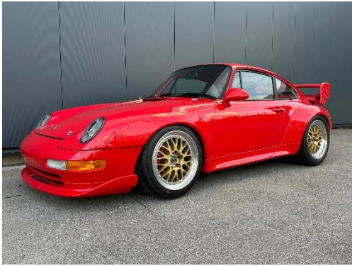
1997 Porsche 993 Carrera RSR Club Sport Almost New Condition

FOR SALE Stock #: 23-044 Year: 1997 Make: Porsche Model: 993 Carrera 3.0 RSR Club Sport Color Exterior: Red Color Interior: Black Mileage: 8,167 Miles (13,145 km) Motor Configuration: M64/75 3.8 Liter, 349 HP Transmission: M50/34 6-Speed Manual Price: Price on Request