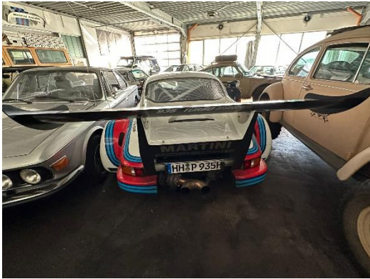
1976 Porsche Modified 935 RSR Ready for Track or Road

FOR SALE Stock #: 23-048 Year: 1976 Make: Porsche Model: Modified 935 RSR Color Exterior: White/Martini Color Interior: White/Black Mileage: 5,062 Miles (8,147 km) Motor Configuration: 3.3 Liter, 930 Turbo Transmission: 6-Speed Manual Price: Price on Request