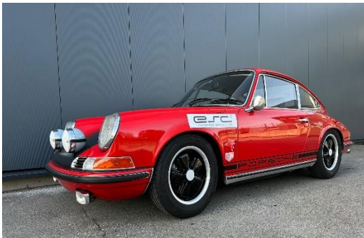
1969 Porsche 911S LWB Matching Numbers

FOR SALE Stock #: 23-054 Year: 1969 Make: Porsche Model: 911S, Coupe, LWB Color Exterior: Repaint Red / Original Burgundy Color Interior: Black Mileage/Odometer: Appr. 52,500 Miles Motor Configuration: 2.0 Liter, 170 HP, MFI, Air Cooled Transmission: 5-Speed Manual Price: Price on Request