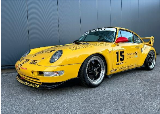
1998 Porsche 993 Carrera Cup Racing, Ready for Track or Road

FOR SALE Stock #: 23-046 Year: 1998 Make: Porsche Model: 993 Carrera Cup Racing Series Color Exterior: Yellow Color Interior: Yellow Mileage: 13,308 Miles (21,418 km) Motor Configuration: M64/70 3.8 Liter, 311 HP Transmission: G5030 6-Speed Manual Price: Price on Request