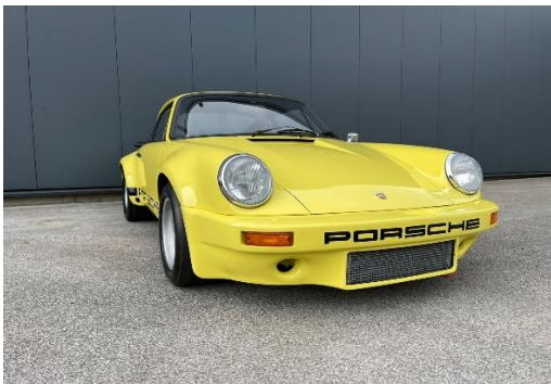
1973 Porsche 911 Modified Carrera 3.0 RS – Ex-Factory Car Ready for Track or Road

FOR SALE Stock #: 23-042 Year: 1973 Make: Porsche Model: 911 Modified Carrera 3.0 RS Color Exterior: Yellow Color Interior: Black Mileage: 6,700 Miles (10,773 km) Motor Configuration: M64/75 3.8 Liter, 349 HP Transmission: M50/34 6-Speed Manual Price: Price on Request